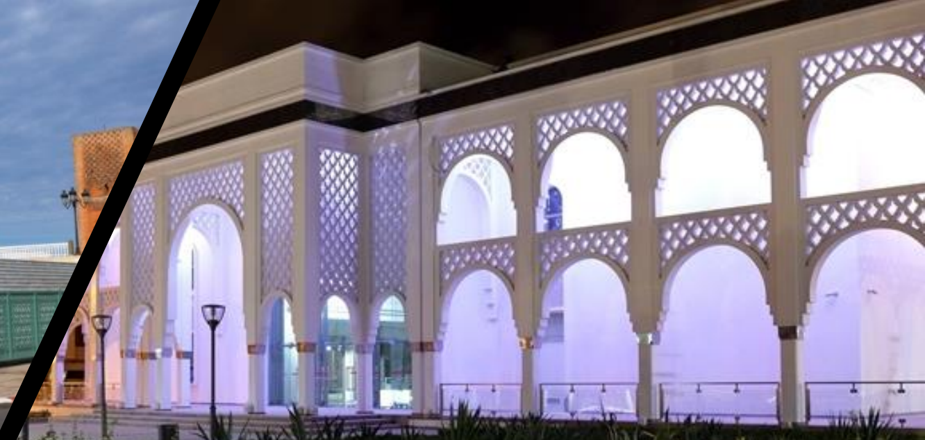
Mohammed VI Museum of Modern and Contemporary Arts