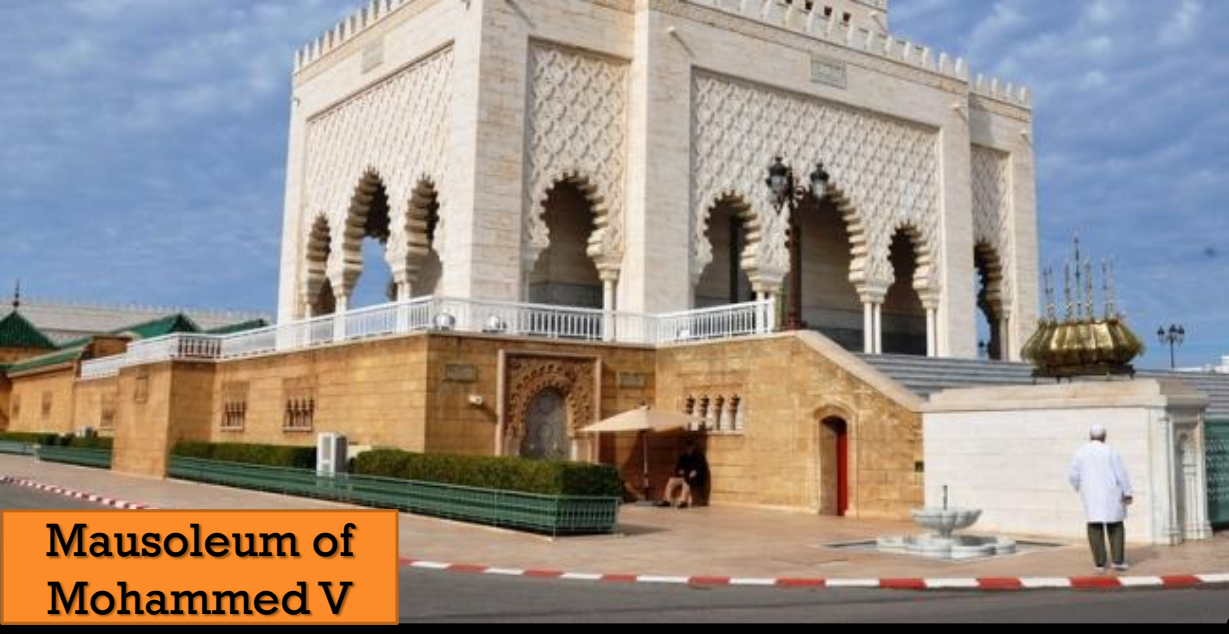
Mausoleum of Mohammed V